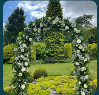
Horseshoe Arch Fresh or Silk Flowers