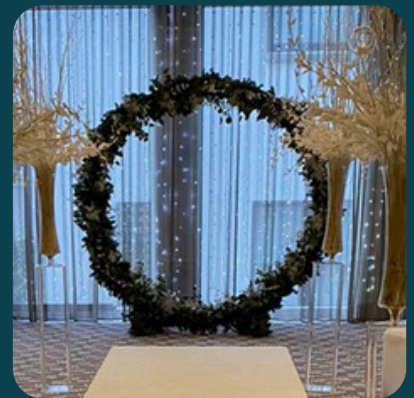
Circular Arch Fresh or Silk Flowers