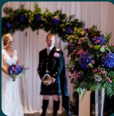
Moongate Arch Fresh or Silk Flowers