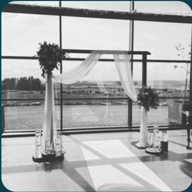
Rustic Arch Flowers and drape